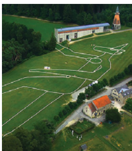
Yona Friedman, La Licorne Eiffel, 2009. Installation at Centre international d'art et du paysage, Ile de Vassivière. Commissioned by Cnap, on loan to Ciap.