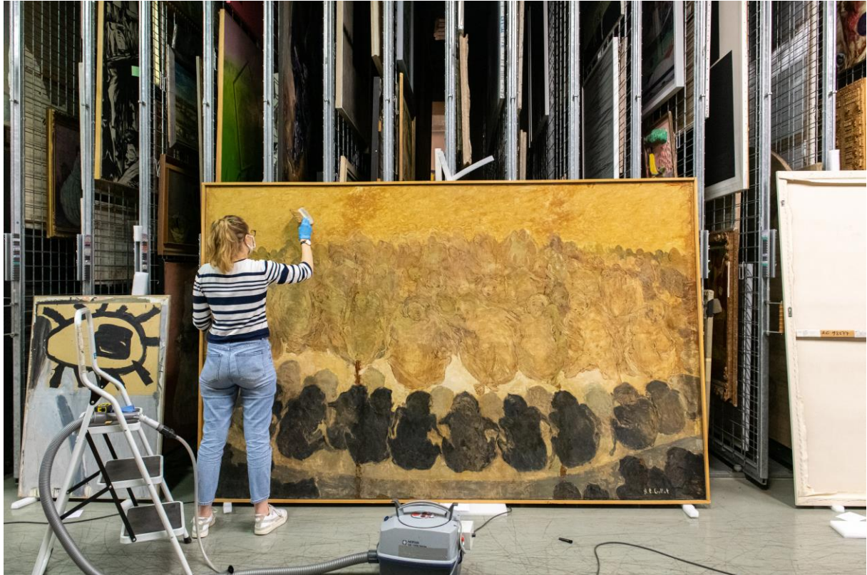
Roger Edgar GILLET, Le narcissisme de groupe, 1974, Huile sur papier marouflé sur toile, 190 x 300 cm (Inv. : FNAC 35164)