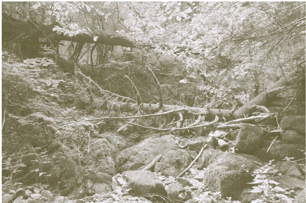
Léa Habourdin, Images-forêts : des mondes en extension , 2021

More at www.rencontres-arles.com/en/expositions/